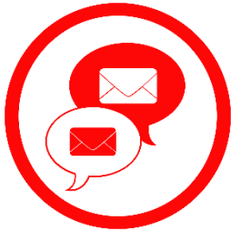
CORRESPONDENCE & INFORMATION